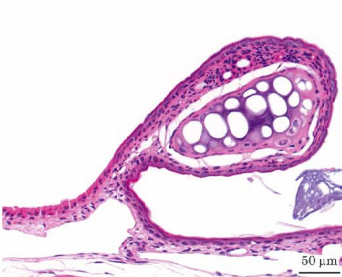
Photograph 5 Nasal cavity: Squamous metaplasia of respiratory epithelium Mouse, Male, 1.6 ppm, Animal No. 0817-1306 (H&E)