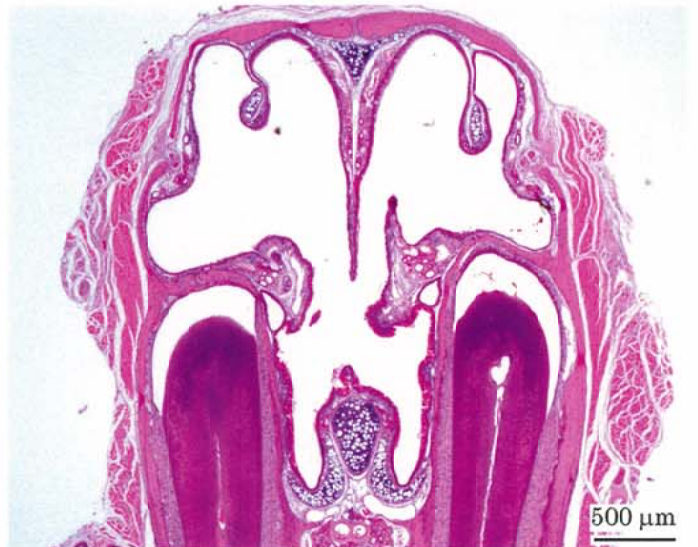
Photograph 6 Nasal cavity: Atrophy of turbinate and septal perforation Mouse, Male, 1.6 ppm, Animal No. 0817-1312 (H&E)