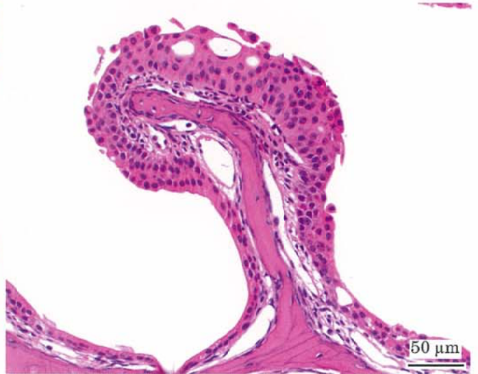
Photograph 4 Nasal cavity: Hyperplasia of transitional epithelium Mouse, Male, 1.6 ppm, Animal No. 0817-1329 (H&E)