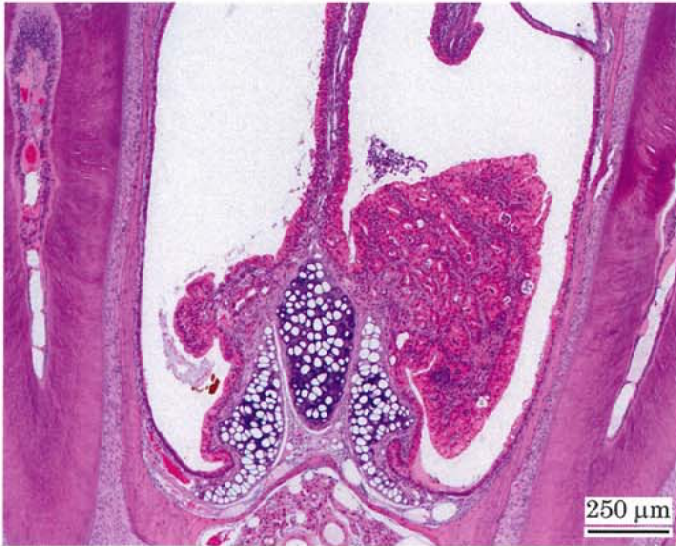
Photograph 1 Nasal cavity: Adenoma Mouse, Female, 1.6 ppm, Animal No. 0817-2308 (H&E)