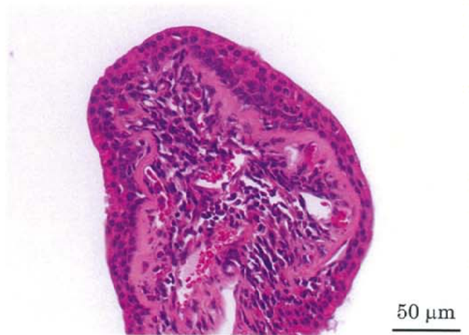
Photograph 2 Nasal cavity (Level 1): Inflammation of transitional epithelium Mouse, Male, 45 ppm, Animal No. 0732-1311 (H&E)