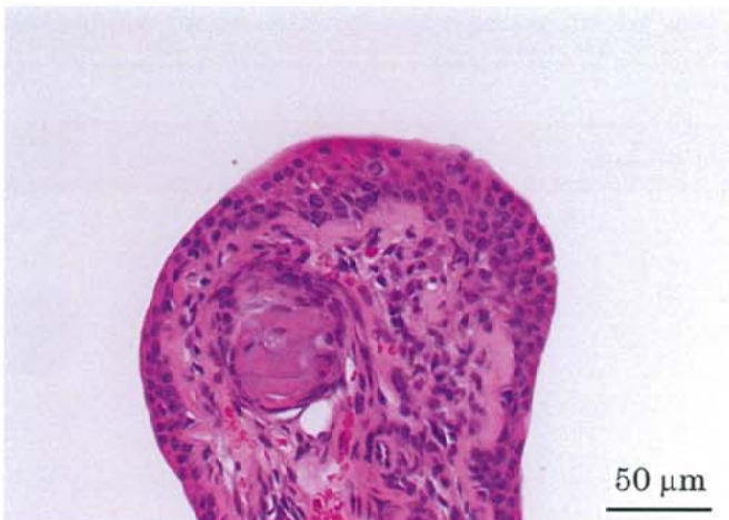
Photograph 3 Nasal cavity (Level 1): Hyperplasia of transitional epithelium Mouse, Male, 45 ppm, Animal No. 0732-1332 (H&E)