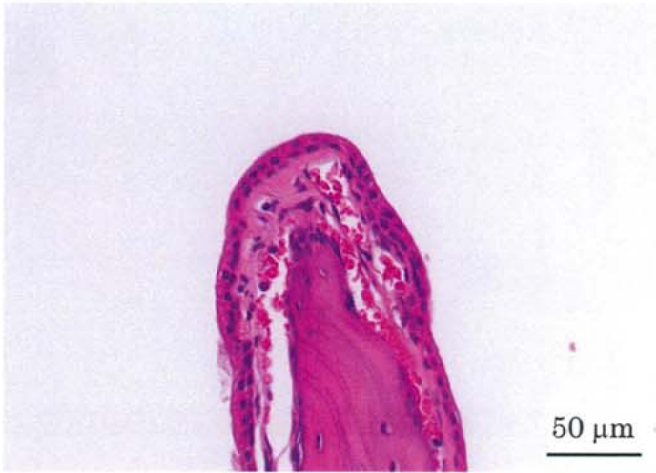
Photograph 1 Nasal cavity (Level 1): Normal, transitional epithelium Mouse, Male, Control, Animal No. 0732-1006 (H&E)