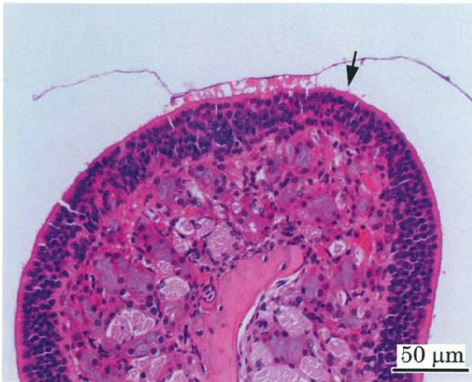
Photograph 1 Nasal cavity (Level 3): Atrophy of olfactory epithelium (arrow) Mouse, Male, 32 ppm, Animal No. 0705-1305 (H&E)