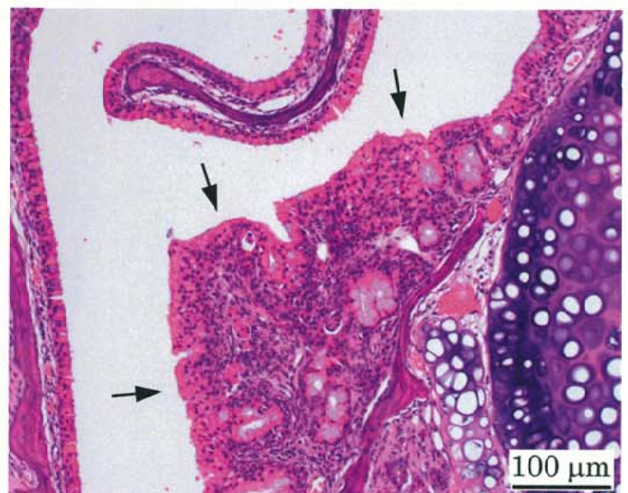
Photograph 4 Nasal cavity (Level 1): Hyperplasia of respiratory epithelium (arrows) Mouse, Female, 32 ppm, Animal No. 0705-2306 (H&E)