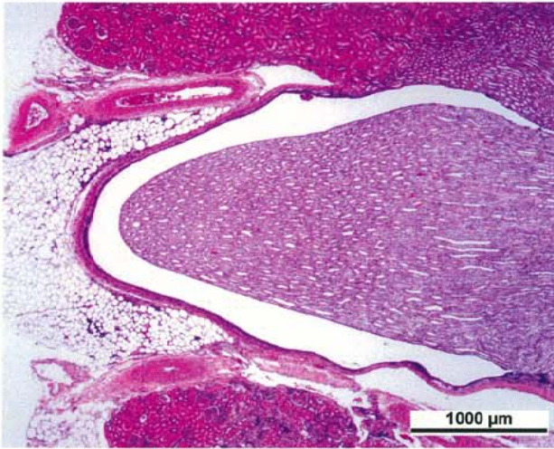
Photograph 1 Kidney: Normal Rat, Female, Control, Animal No. 0641-2007 (H&E)