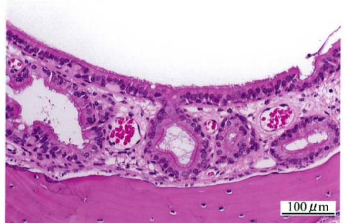
Photograph 2 Nasal cavity: respiratory metaplasia of the olfactory epithelium and submucosal gland Mouse, Male, 4000 ppm, Animal No. 0611-1327 (H&E)