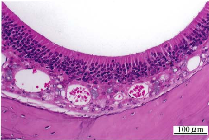
Photograph 1 Nasal cavity: Normal Mouse, Male, Control, Animal No. 0611-1013 (H&E)